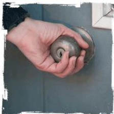
For everyone who asks receives, and for everyone who searches finds, and for everyone who knocks , the door will be opened. Luke 11:10, NRSV

June 13 & 14 Daring to Act Ruth 3:1-18 Psalm 108:1-6 Matthew 7:7-11