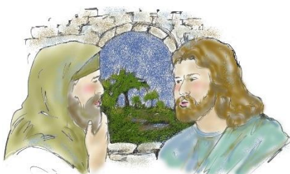
Jesus Teaches Nicodemus

When Nicodemus talks with Jesus late at night, he learns about the difference between the spiritual and the physical. The two are intertwined but it is the Spirit which gives life. We are invited to be open to the Spirit's call to have faith in Jesus.