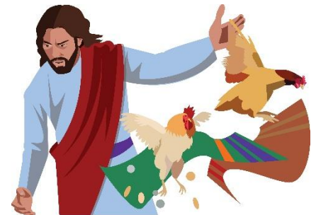
Jesus Cleanses the Temple

Jesus gets really angry at those who were disrupting the prayers of the women. So much so that he drove out of the temple all of those who were buying and selling animals for sacrifice. Beware of those who are trying to sell you religion! They are after your money, and they don't really care about your faith.